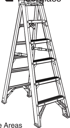
Circle Areas of Damage